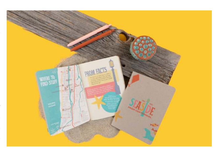
Read more about it HERE .

Scout Books published a case study on our Seaside Prom Centennial booklets on their website, alongside a fun interview with me about the Centennial project and Seaside as a destination. Scout Books was one of the key partners for this endeavor – our publishing partner – along with Travel Oregon (grant funding), Lookout (creative), and Integraf (holographic stickers). Essentially, the case study signals they feel strongly enough about the project to highlight it for other potential clients to see the possibilities in their books... quite a nice nod for our work's outcome, I think.